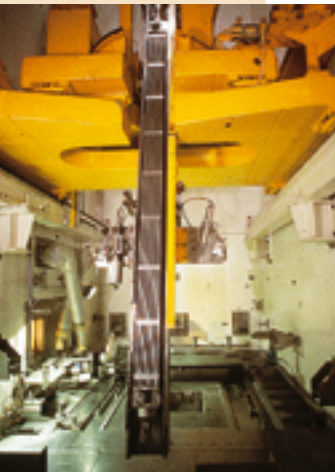
Tilting crane: feeder bridge in shearing facility.

T1 facility operate the specific treatment process linked to the characteristics of these RTR fuels since 2005.